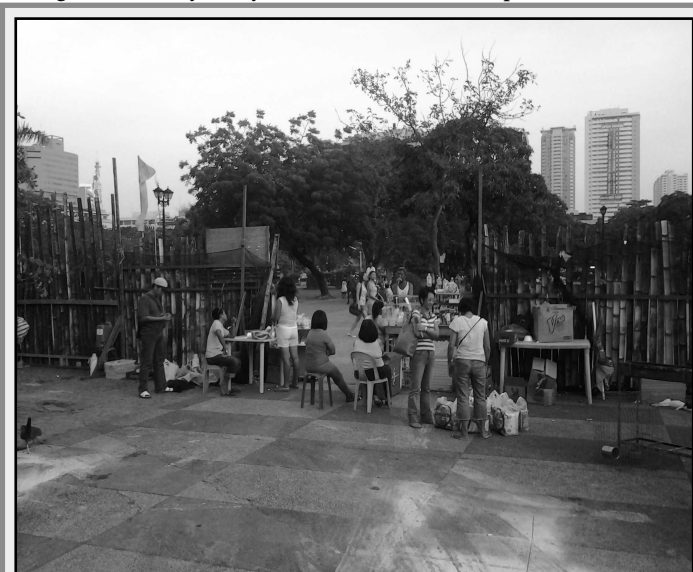
THE VENDORS IN NATIONAL PARK

to make problems to the vendors. Because with the wall in front they cannot sell anything. The vendors are still inside the place but it is hard now because there is a wall. They cannot sell anything and we think the management are killing them slowly. They do